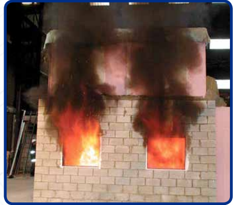
FULL SCALE FIRE TEST

We are recognised as experienced and leading experts in the commissioning of load-bearing fire resistance tests, acoustic laboratory and field tests, weather resistance tests and tests for other building product and system performance characteristics.