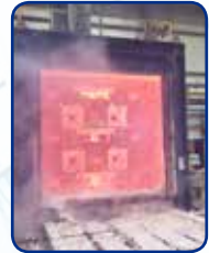
BEFORE AND AFTER PICTURES OF LOAD BEARING EN1365-1 : 2012 FIRE TEST