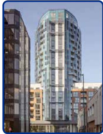
VISION MODULAR BBA, BOPAS & LABC CERTIFIED 25 STOREY MODULAR BUILDING SYSTEM

Our other areas of expertise include those listed below.