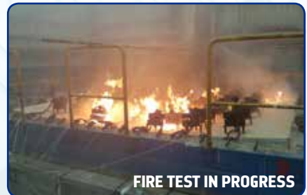
FIRE TEST IN PROGRESS