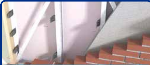
FUSION BUILDING SYSTEMS PATENTED THERMALLY BROKEN WALL TIE BRACKET SYSTEM

We can advise you of the development steps required to bring your construction product to the forefront of the market, keeping you ahead of your competitors, using the principles of the stagegate process.